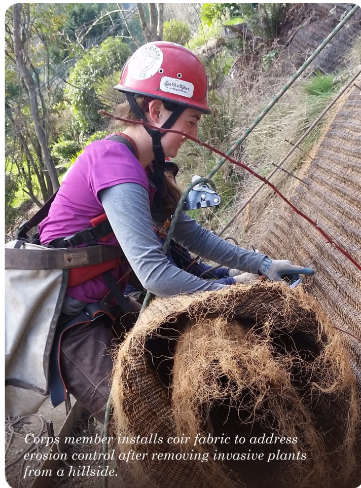
Corps member installs coir fabric to address erosion control after removing invasive plants from a hillside.

6310 NE 74th Street, Suite 201E Seattle, Washington 98115 206.322.9296 | www.earthcorps.org Tax I.D. #91-1592071