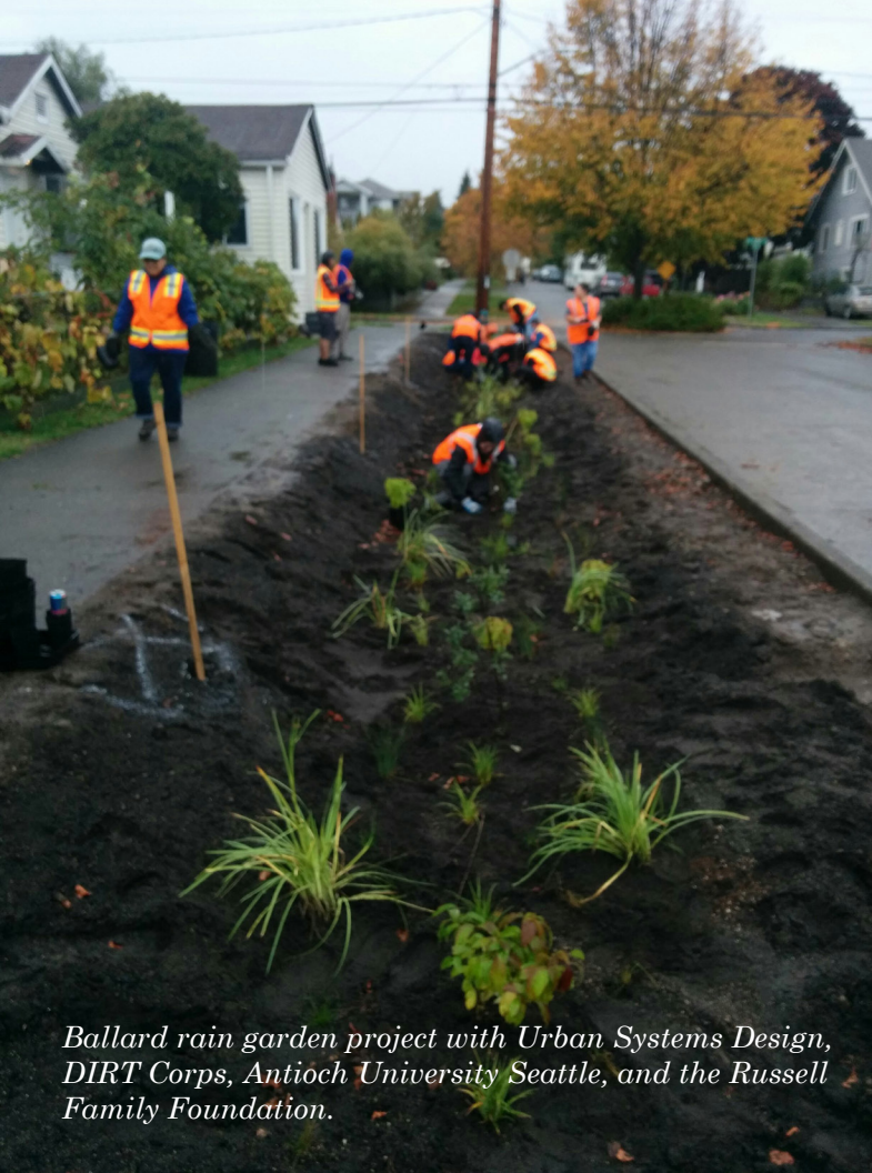
Ballard rain garden project with Urban Systems Design, DIRT Corps, Antioch University Seattle, and the Russell Family Foundation.