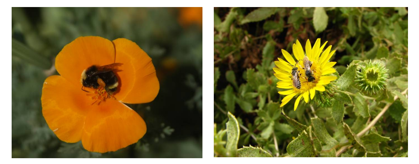
Bumble bee on California poppy