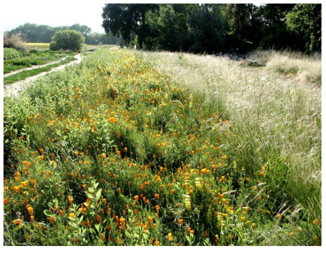
Pollinator habitat along edges of riparian zone

Entrances to these ground nesting nests resemble ant hills but have larger entrances